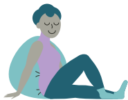
Space for Rest for Women