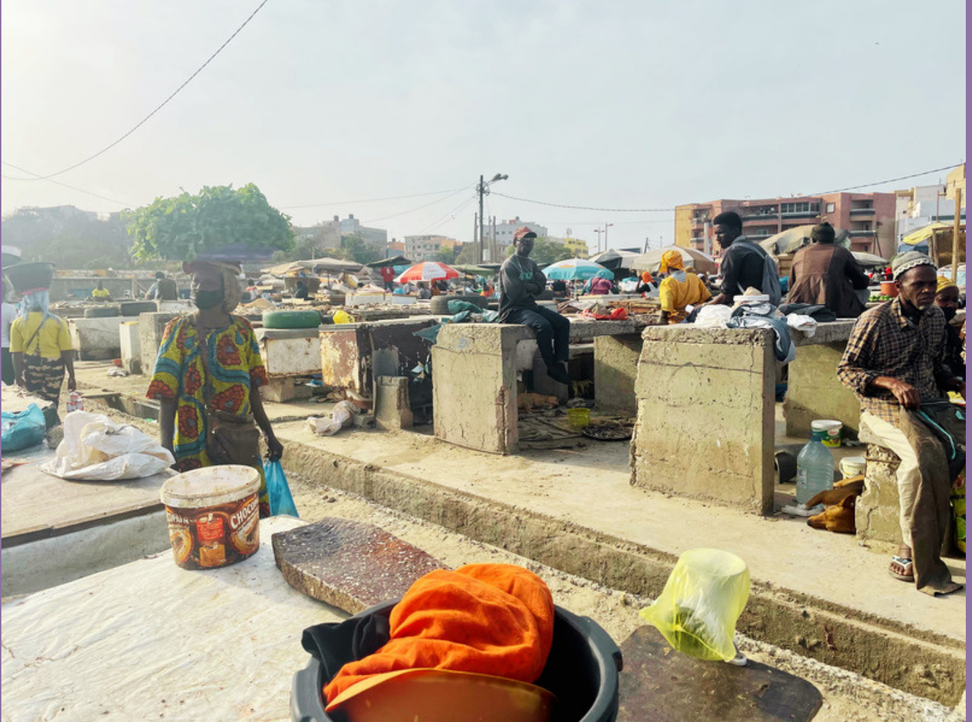
Existing fishers market, Sombédioune, Senegal

The UN Capital Development Fund makes public and private finance work for the poor in the world's 46 least developed countries (LDCs).