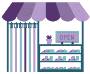
Construction of the Market Roof