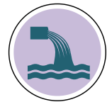
Provision of Sewage System