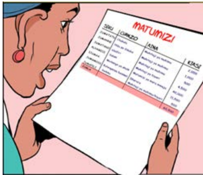
Mama Malengo creates her first budget.

The comic currently has three issues with the following learning objectives: